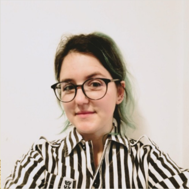
Miss Bedford Apple Class